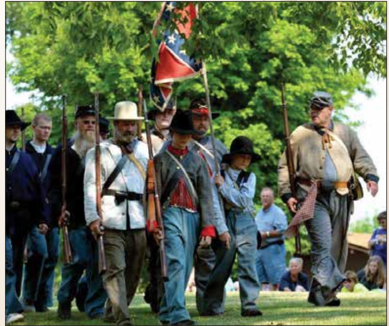
A reenactment of the Army of the Southwest from 2011.

The reenactment is a living history where members pitch tents, fight skirmishes and carry on camp life as it would have been done in the great conflict. Visitors can expect to see replicas of the tents, clothing and weaponry that were used by both the soldiers and civilians.