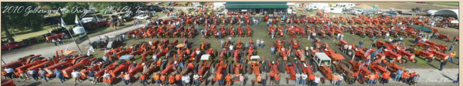
This was the feature area during the 2010 show that hosted the Gathering of the Orange and featured Allis-Chalmers.

The board wishes to make the show accessible to all, while keeping safety in mind for all guests. Trolley rides are available from the parking lots to the grounds and throughout the grounds including to and from the field demonstrations.